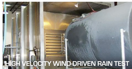
HIGH VELOCITY WIND-DRIVEN RAIN TEST