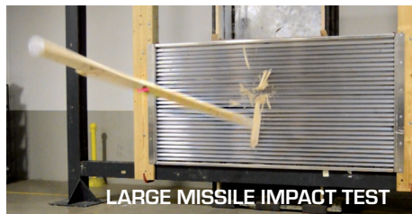
LARGE MISSILE IMPACT TEST

AMCA, The Air Movement and Control Association, lists louvers that comply with the AMCA 540 impact and /or AMCA 550 high-velocity wind-driven rain test standards. AMCA's Listing Program is governed by AMCA Publication 512.